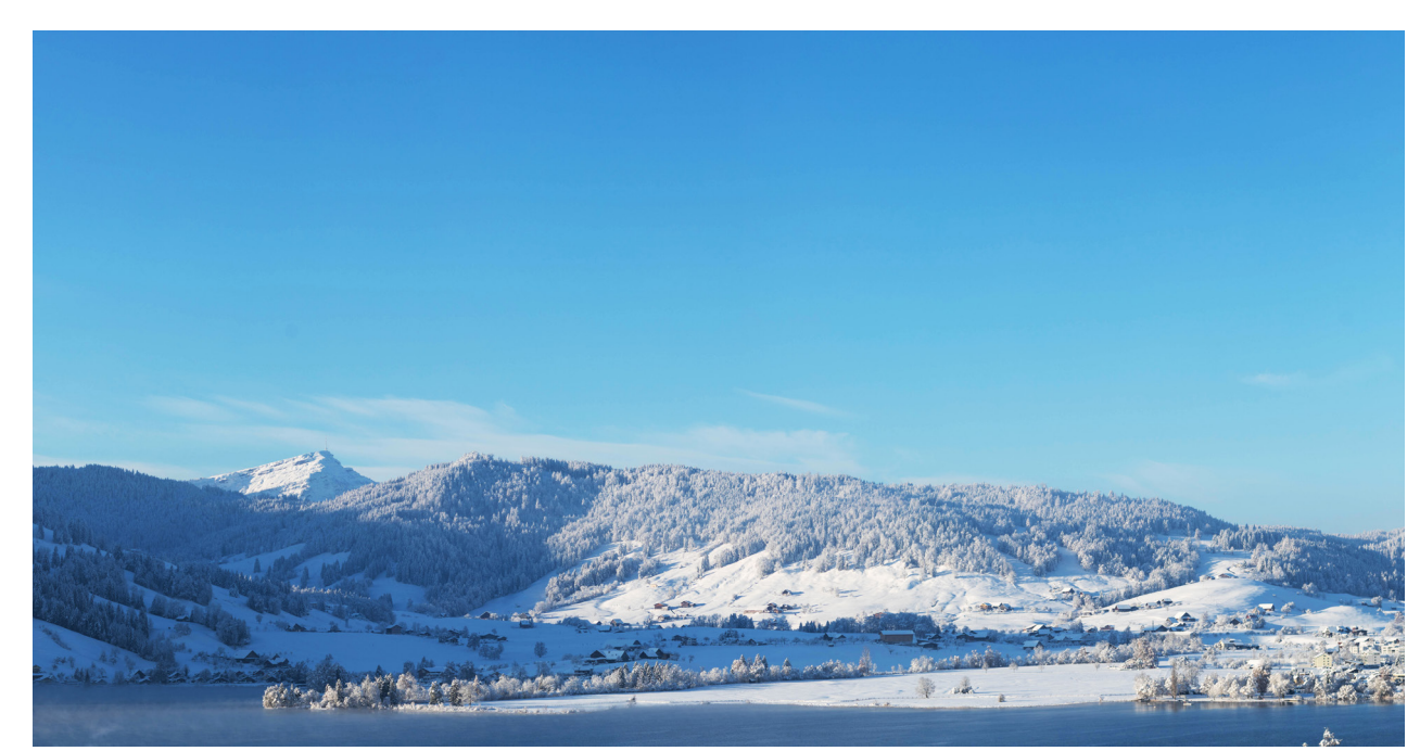
View from the foot of the Zugerberg